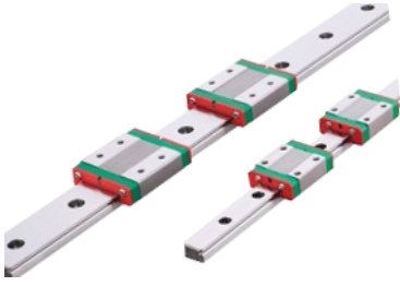
EGR-T Dimensions for EGR-T(Rail Mounting from Bottom)